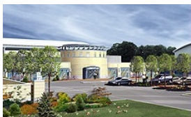
MSG Training Center