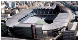
Ali Sami Yen Stadium