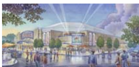
U.S. Cellular Coliseum