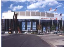
Air Canada Centre