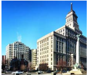
330 University Avenue