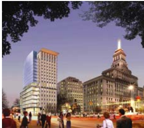
180 Queen Street West