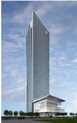
Simcoe Centre (Ritz Carlton) and Condominium