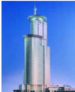
Shanghai International Ocean Shipping Centre

This 120,000 square metre 50 storey building includes 10 levels of residential and six levels of retail.