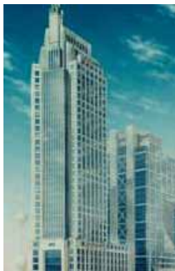
Shanghai Pudong Development Bank

Luxury condominiums located above retail and office complex. The project was part of a massive redevelopment effort which included the preservation and re-use of a 1926 terminal building. Base building cooling plant utilizes lake water for condensing and free cooling. Major renovations from 1998 to 2002 converted retail space, executive suite offices floor, upgraded ventilation systems, building central cooling system and electronic controls and monitoring systems. Presently completing major renovations to enhance energy performance of cooling and heating systems, including demand control ventilation, condensing heating boilers and heat recovery upgrades.